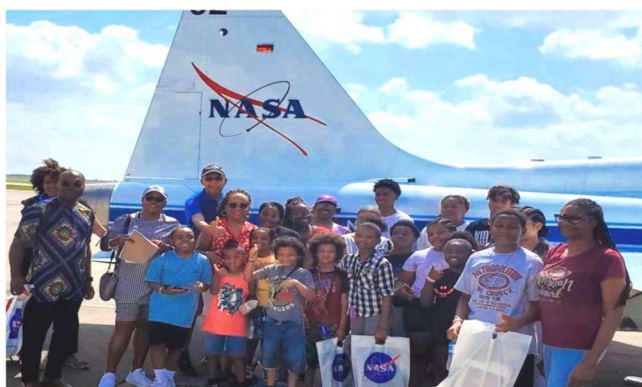
Some of the participants of the Children's Fly-In At Ellington Field.

Thank you to the parents, grandparents and guardians who brought their children out to participate in the Children's Fly-In held at Ellington Field .