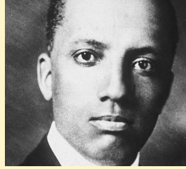
Carter G. Woodson

Carter G. Woodson is credited with starting Black History Month, originally establishing it as "Negro History Week" in 1926 to celebrate the achievements of African Americans throughout history.